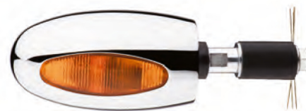
It all took off for Kellermann in the mid 1990s with the ubiquitous BL 1000 indicator