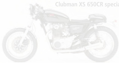
LSL's 30th Anniversary Clubman XS 650CR special