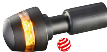
reddot design award

This year Kellermann won the latest of several Red Dot Design Awards - for their BL 2000 indicator (seen here above) and stylish advanced licence plate design